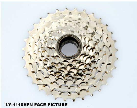
LY-1110HFN FACE PICTURE